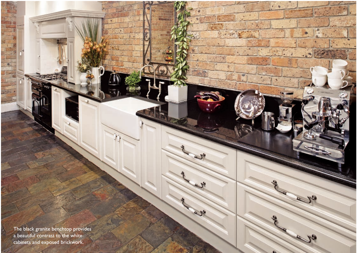
The black granite benchtop provides a beautiful contrast to the white cabinets and exposed brickwork.