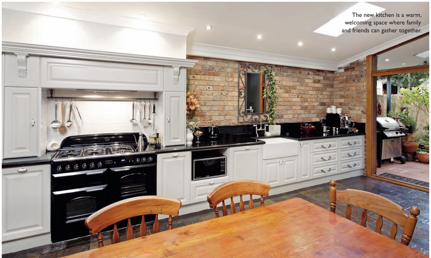
The new kitchen is a warm, welcoming space where family and friends can gather together.

“It was important not to over-indulge in all that provincial style has to offer as this can detract from achieving a sense of ease in a narrow room,”