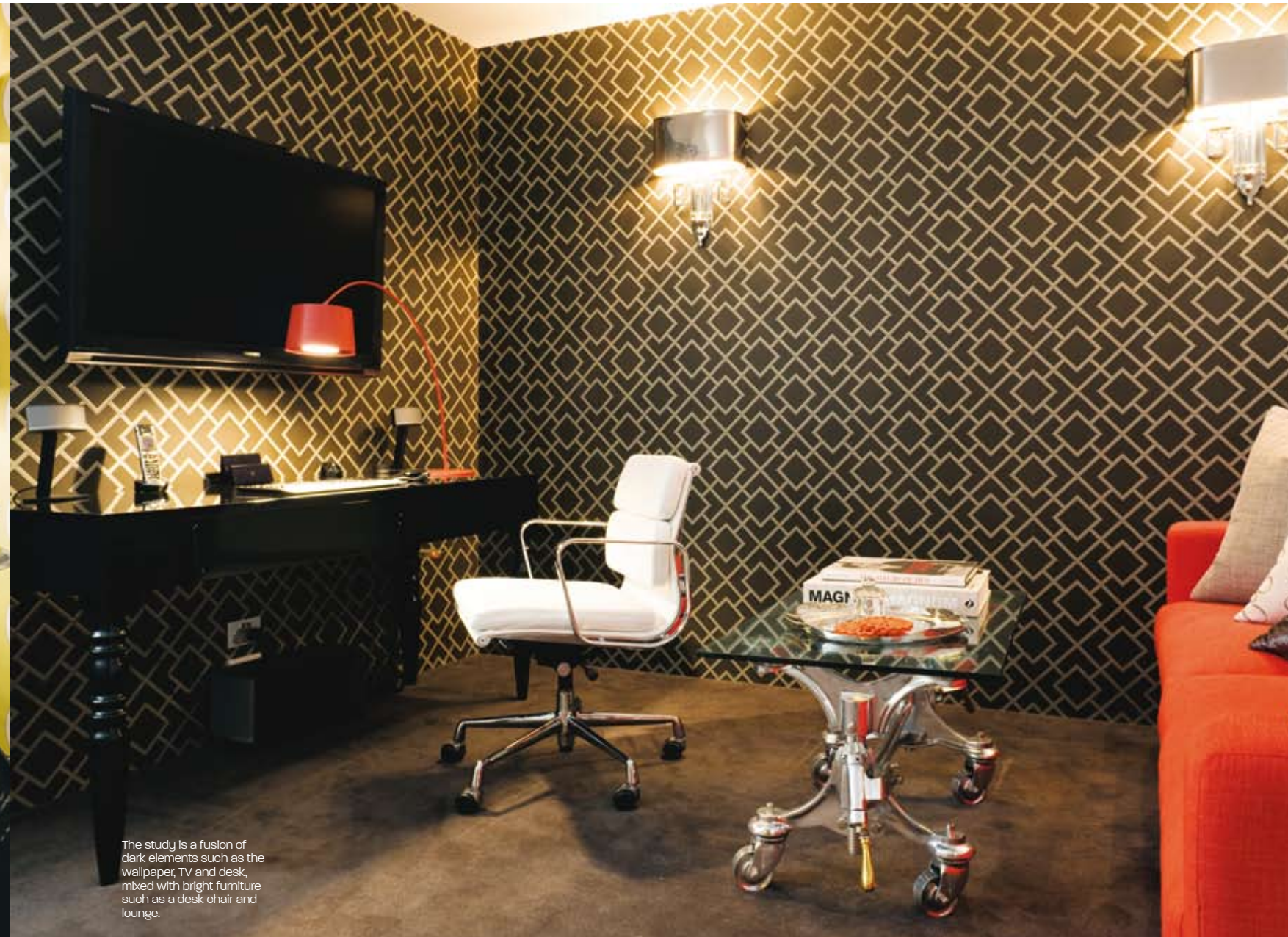
The study is a fusion of dark elements such as the wallpaper, TV and desk, mixed with bright furniture such as a desk chair and lounge.

that is typically monotone," says Natasha. "The recessed bar back, along with the decorative Bisazza gold leaf splashback, are a real focal point, giving this kitchen an interesting feature out of a surface that is normally bland."