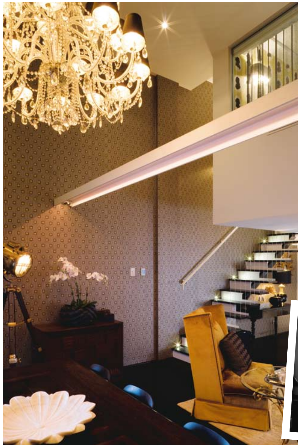
Left: A stunning, sophisticated chandelier lights up the apartment and adds glamour. Below: By implementing one long sheer white curtain, backlit with embellished wall sconces, the walls became soft subtle surfaces that were a feature rather than distraction in the open space.