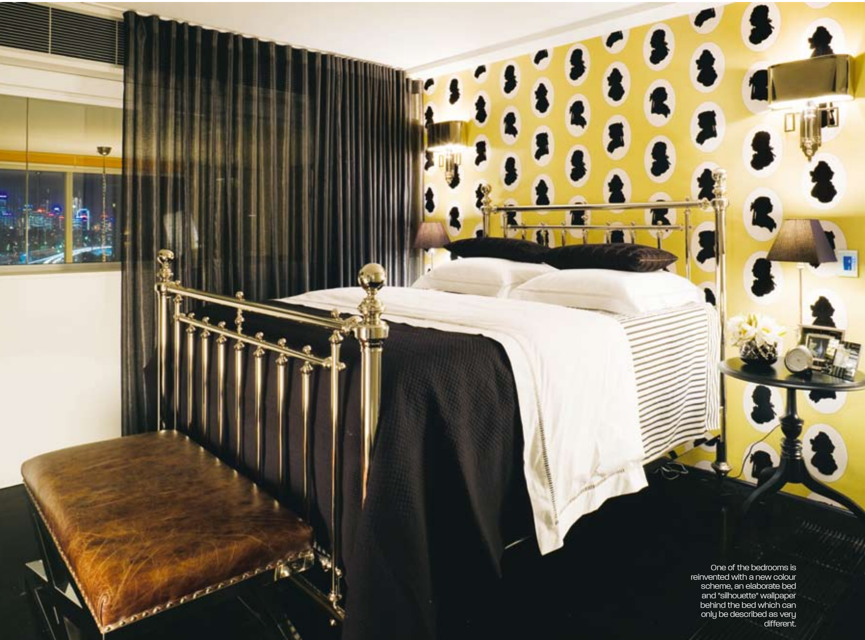
One of the bedrooms is reinvented with a new colour scheme, an elaborate bed and "silhouette" wallpaper behind the bed which can only be described as very different.