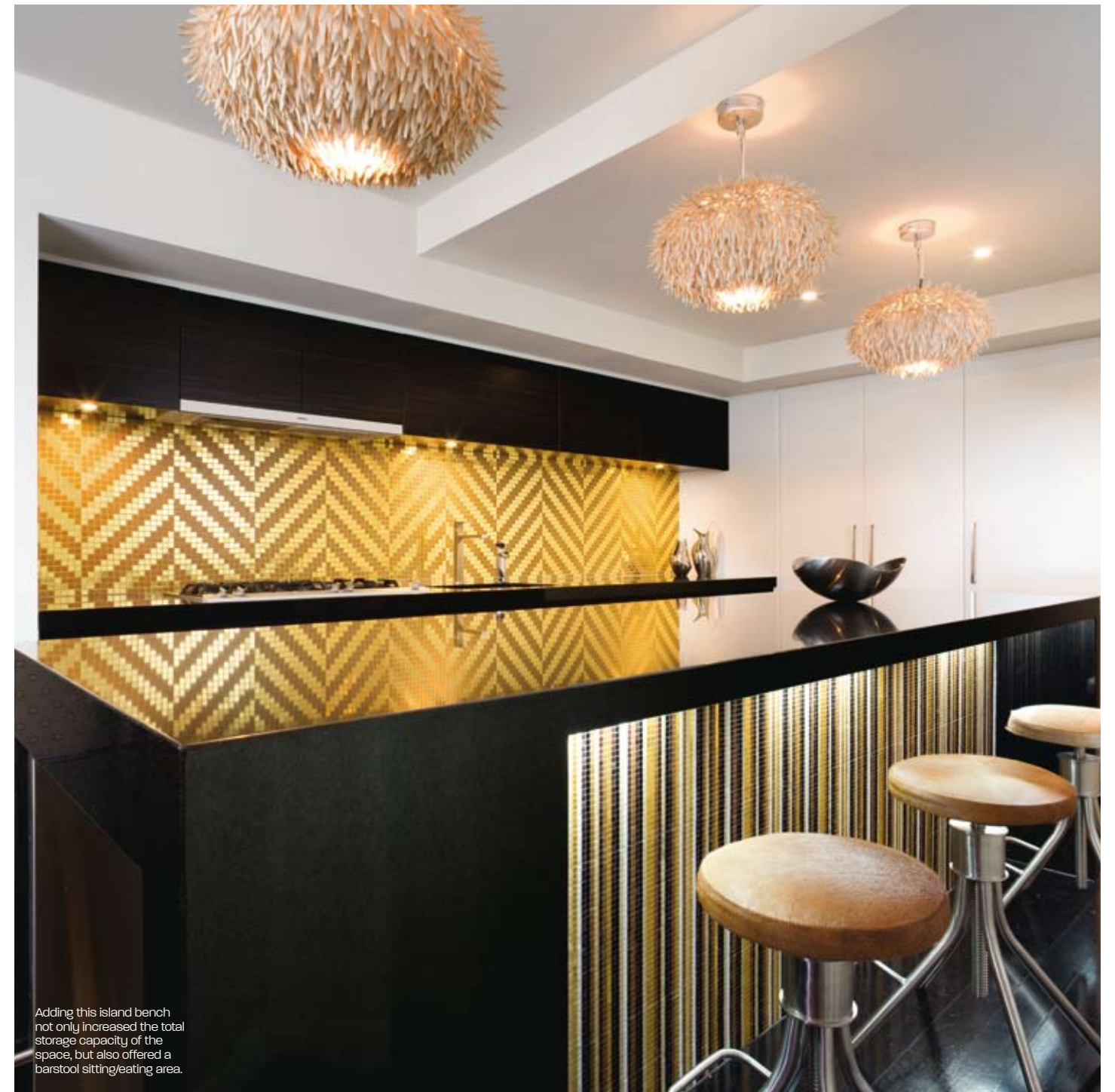
Adding this island bench not only increased the total storage capacity of the space, but also offered a barstool sitting/eating area.

re-orientating the floorplan, I was able to create a whole new dining zone elsewhere, which, as a result, opened up the opportunity to implement a much-needed island bench," she explains. Introducing the bench was the pivotal point for this kitchen in terms of how it could be used. Adding this not only increased the total storage capacity of the space, but also offered a barstool sitting/eating area," she explains. This concept of the bench also gave them the option of being able to incorporate another dining zone in this wide space. The central island bench, finished in Nero Assoluto granite, incorporates an Ecofire in one end, allowing an open-plan flow from living to kitchen.