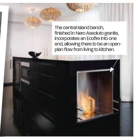
The central island bench, finished in Nero Assoluto granite, incorporates an Ecofire into one end, allowing there to be an open-plan flow from living to kitchen.