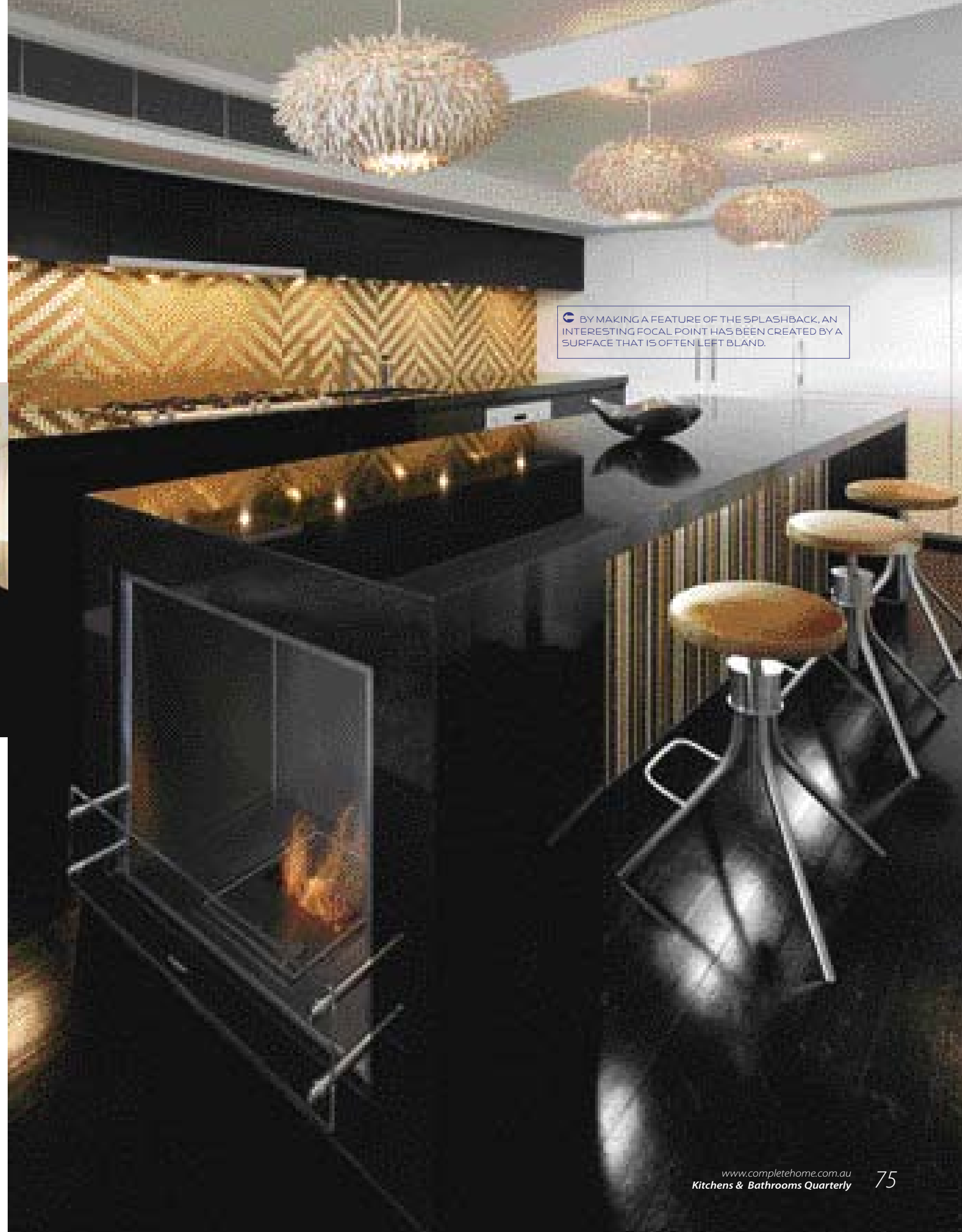
BY MAKING A FEATURE OF THE SPLASHBACK, AN INTERESTING FOCAL POINT HAS BEEN CREATED BY A SURFACE THAT IS OFTEN LEFT BLAND.

A trendy inner-city apartment offers an unmatched lifestyle, but as the owners of this kitchen discovered, it doesn't come without its disadvantages. Cramping multiple features into a space-deprived unit proved to be a challenge but expert help was at hand in the form of Kitcheners Kitchens' talented design team and an interior designer from Coco Republic. The two parties worked together with the client and transformed the high-rise hut into a haven.