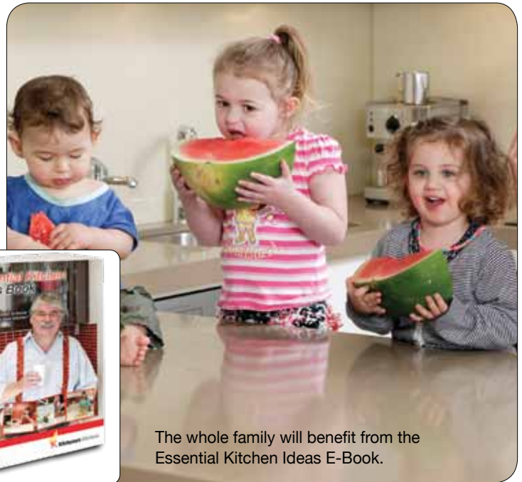
The whole family will benefit from the Essential Kitchen Ideas E-Book.

To download a copy of the free kitchen e-book go to www.kitcheners.com.au or contact Kitcheners Kitchens on 1800 826 144